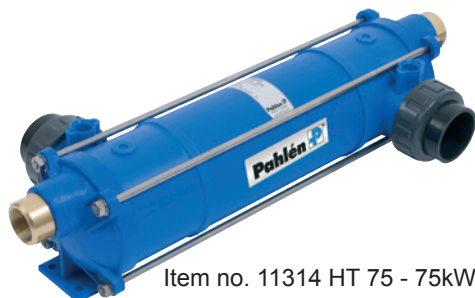
Item no. 11314 HT 75 - 75kW